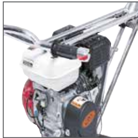
FOLD DOWN HANDLE