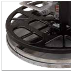
ROTATING GUARD RING